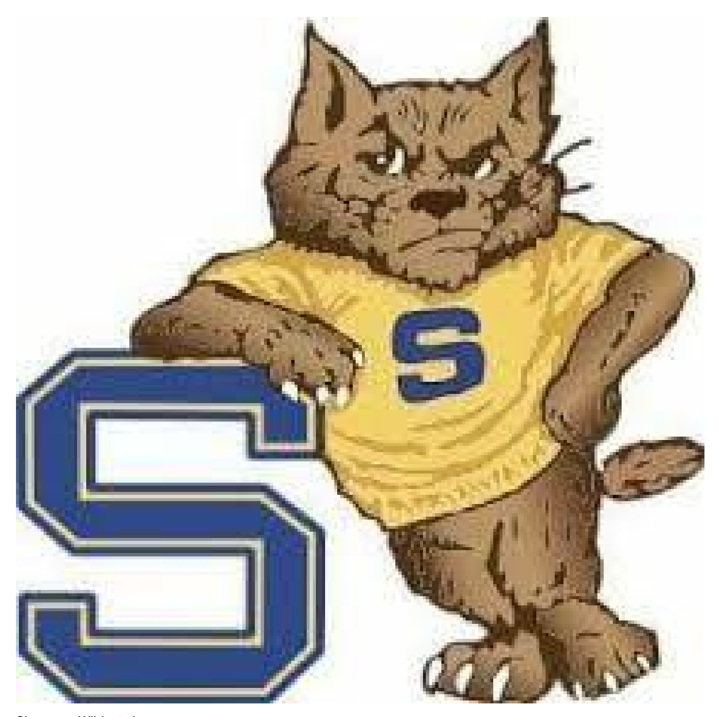
Shenango Wildcats logo

By Maria Basileo New Castle News Aug 26, 2019 Updated 13 min ago